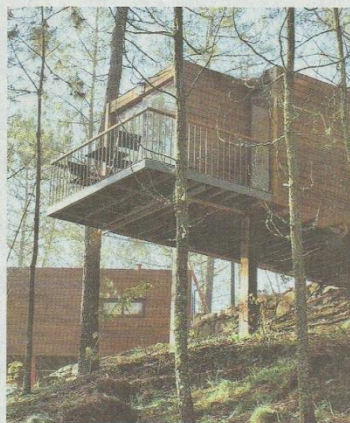
Treehouse fun at the Lima Escape in Braganca, Portugal, above

● Domes from £75 per night for up to six people (08443 440196; glistencamping.com).