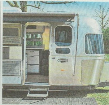
Accommodation at Ca'savio in Italy is in American Airstreams, above

16 On the 40th anniversary year of Shakespeare's death, this simple tipi camping site four miles outside Stratford upon Avon is well placed for a car-free history holiday. Interior furnishings